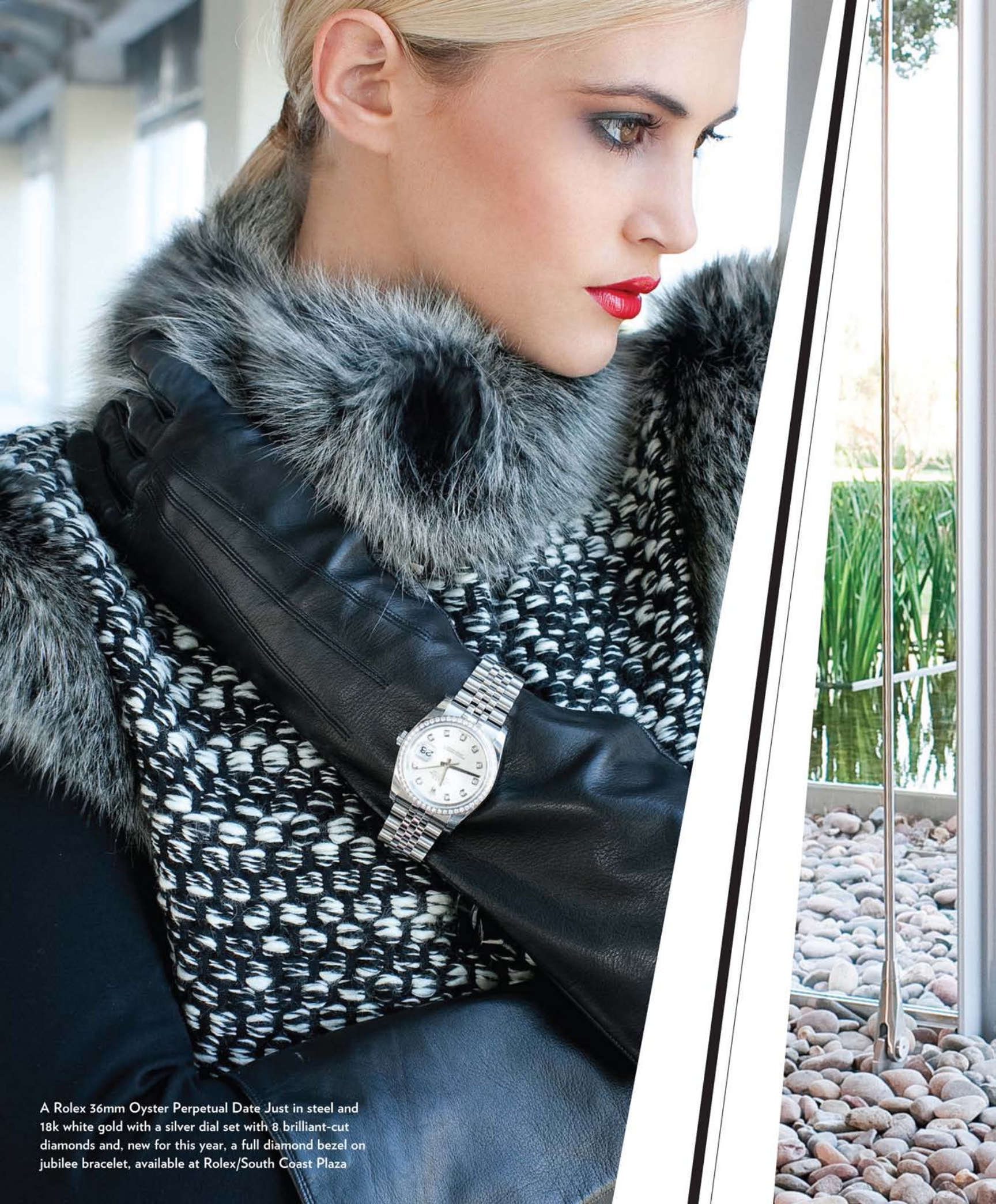
A Rolex 36mm Oyster Perpetual Date Just in steel and 18k white gold with a silver dial set with 8 brilliant-cut diamonds and, new for this year, a full diamond bezel on jubilee bracelet, available at Rolex/South Coast Plaza